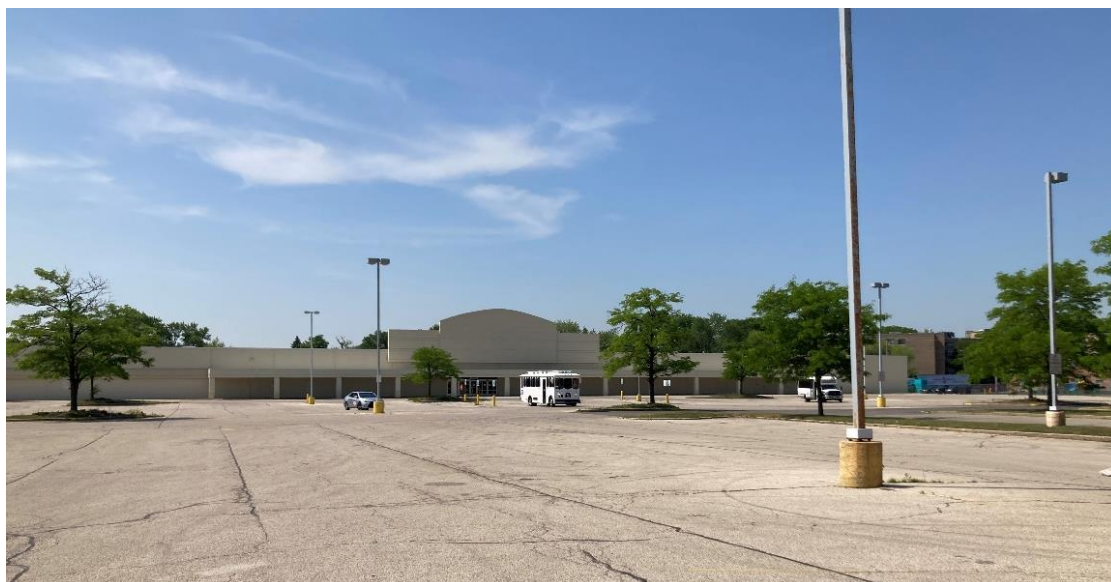
View of the Kmart site, looking south. June 2, 2023.

In addition to the Oaks and Kmart site parcels, City staff asked the panelists for their opinions about appropriate uses for a City-owned parcel of land located to the east of the Metra NCS tracks along Oakton Street, adjacent to the tracks. Although City staff thought that a multi-family development would be a suitable use for this parcel considering that it would be consistent with the previous use (a mixed-use building on the parcel was demolished because its condition had deteriorated), residents have expressed a desire to designate this lot for commuter parking associated with a future NCS station, which would also serve the nearby businesses located east on Oakton Street. The panelists believed that given the size of the parcel (1.5 acres) and its location, commuter parking would not be the highest and best use of this parcel. Instead, the panelists recommended that the site could support a small apartment building, and an associated residential off-street parking lot located in the rear. The panelists believed that commuter parking for the new Metra station could be located west of the tracks within the Oaks redevelopment site via a shared parking agreement. In addition, Metra staff indicated that the parcel would not be a suitable location for a station depot, which should be located on the west (inbound) side of the tracks.