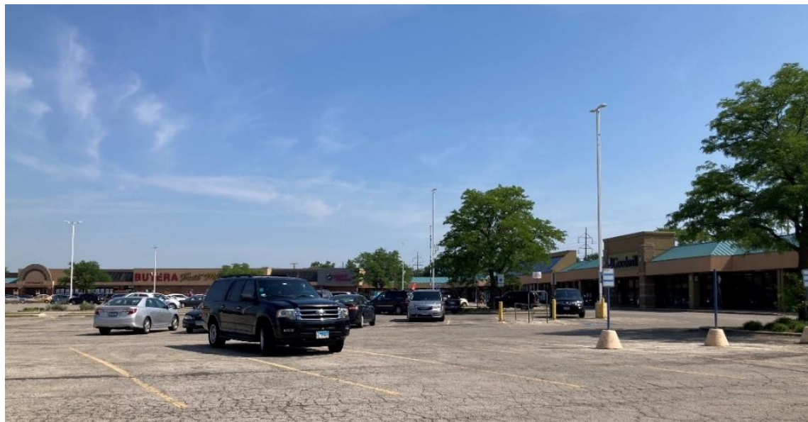
View of the Oaks site looking northeast, with Butera Fruit Market in the background. June 2, 2023.

To build on the grocery store anchor use, the panelists recommended that the City consider attracting additional food and entertainment uses, as well as a medical clinic. A brewery, additional restaurants, or other entertainment uses would help to fill the gaps in the existing mix of businesses in the study area while also creating destinations to which new and nearby residents could easily walk.