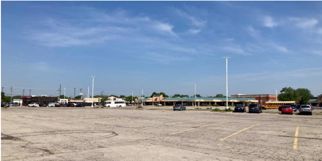
View of the Oaks site looking northwest. June 2, 2023.

Des Plaines staff inquired with the property owners at both study area sites regarding their vision for redevelopment, short-term plans for the property, and what they view as the property's strengths and opportunities. The owner of the Oaks site (NE corner) stated that they have no short-term plans for new development on the property but that they envision "a fully leased vibrant shopping center...as the economic needs, activity, and market conditions of Des Plaines and its surrounding communities evolve and improve into the future." In addition, the property owner stated that the site benefits from its location along major thoroughfares, proximity to a variety of transportation modes, and strong anchor tenancies (grocery, fitness, and thrift retail). When asked if they had considered potential development scenarios, the property owner stated that they "would actively pursue opportunities that enhance the value of the property and believe that the site could be more densely developed with the right mix of tenants." Des Plaines staff did not receive responses from the owners of the Kmart site (SW corner).