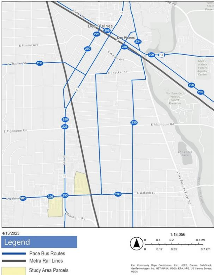
Des Plaines Developer Panel Study Area map

The study area for the panel discussion included three large parcels, generally located at the intersection of Oakton Street and Lee Street. The parcels are privately-owned by two different landowners.