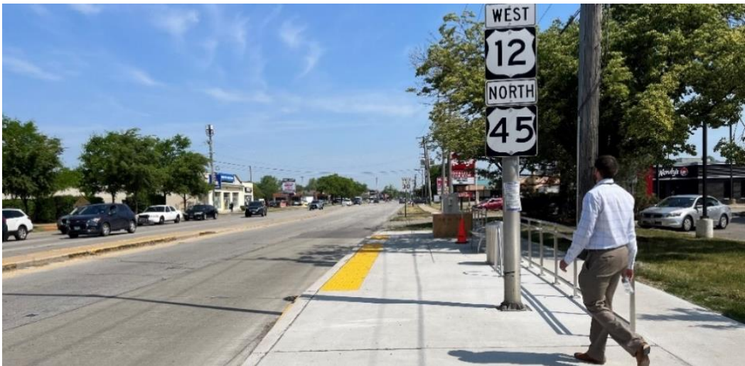
Pace Pulse Dempster Line stop under construction along Lee St, looking north. June 2, 2023.